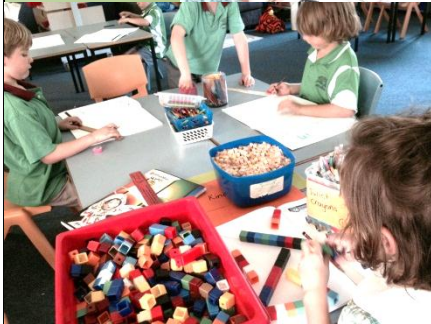
Working on Lego comic making