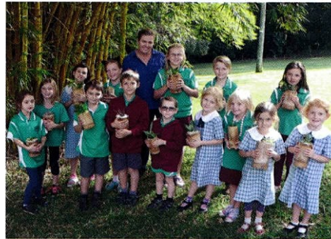
Fernleigh Students

'Together we grow to become stronger and smarter' So much a part of this school is its inclusiveness, where no child is bullied, no tear unnoticed, yet every child is primed to succeed.