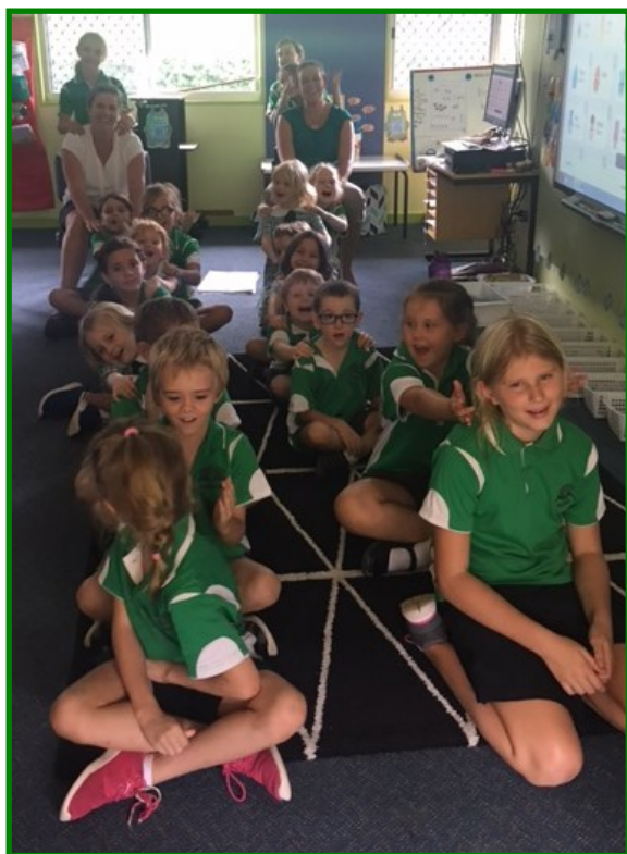
Our afternoon massage trains were so relaxing.

This is a reminder to all parents that we need to continue to respect the privacy of other students and their families. If you are taking photos or video footage of school activities, please stay focused on your child. The images that you capture are not to be uploaded onto any social media sites, including YouTube, Facebook and like sites, without the express permission of the students concerned, their parents and the school. We appreciate your ongoing cooperation in regard to this matter.